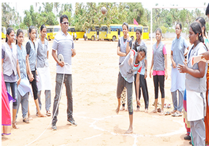
College Sports Day - 09.08.2019