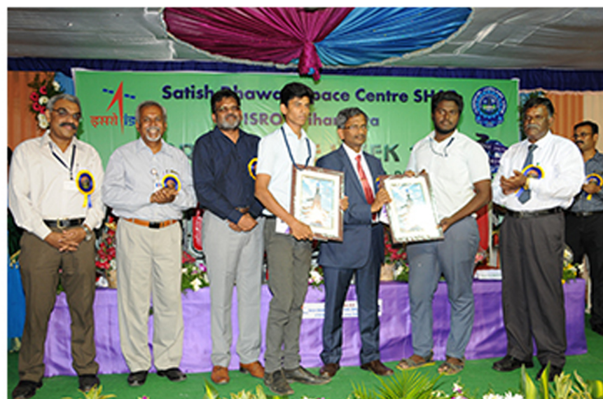
World Space Week 8 th , 9th & 10 th of Oct 2018 - 3 days