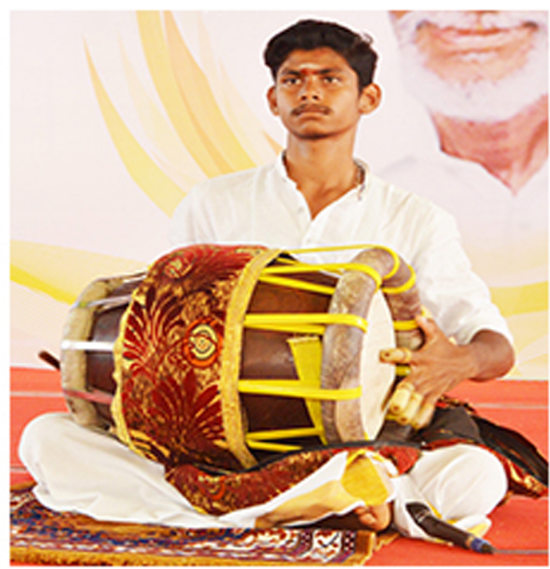
Founder 's Day & College Day - 25.02.2020