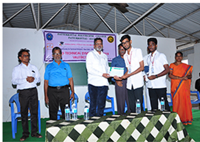
International Literacy Day on 3rd ,6th & 7th of Sep 2019 - 3 days