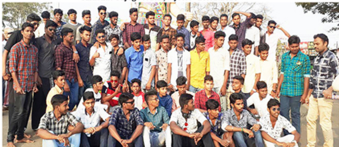
Nandi Automation, Hosur - 28.02.2020