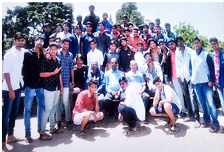
Ooty - 29.02.2020