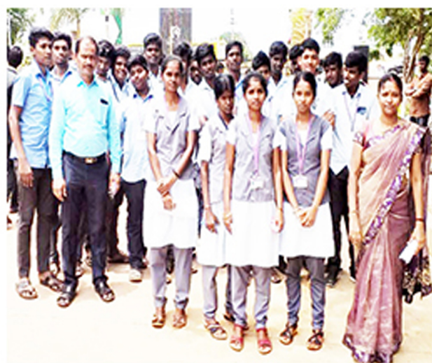
IIFPT, Thanjavur - 16.09.2019