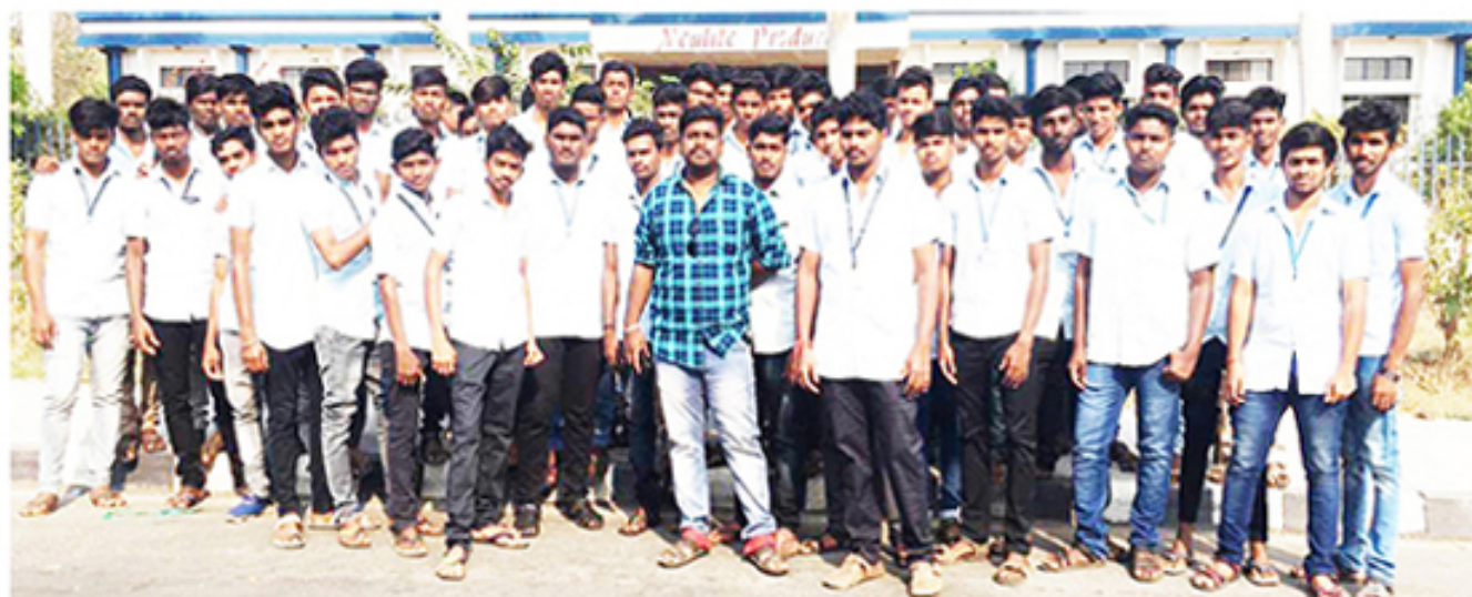
Anubhav Udyog Pvt Ltd., Mysore - 29.02.2020